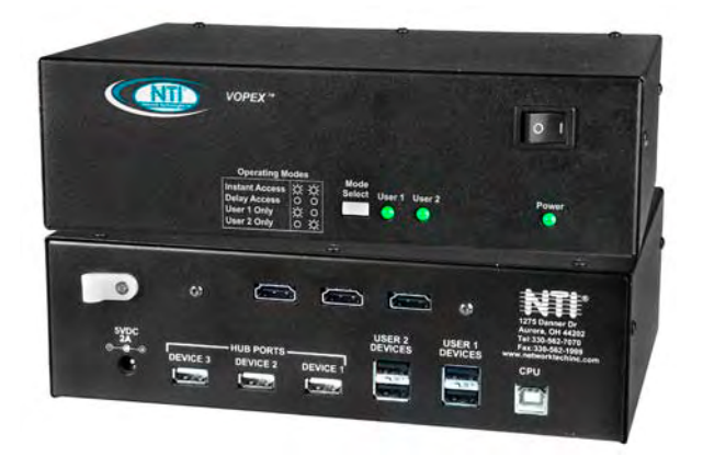
VOPEX-USBH-2 (Front & Back)

The VOPEX® HDMI/DVI USB KVM splitter with built-in USB hub allows up to four users (four USB keyboards, USB mice and DVI/HDMI monitors) to access one USB computer and up to three USB devices (printers, scanners, security cameras, etc.).