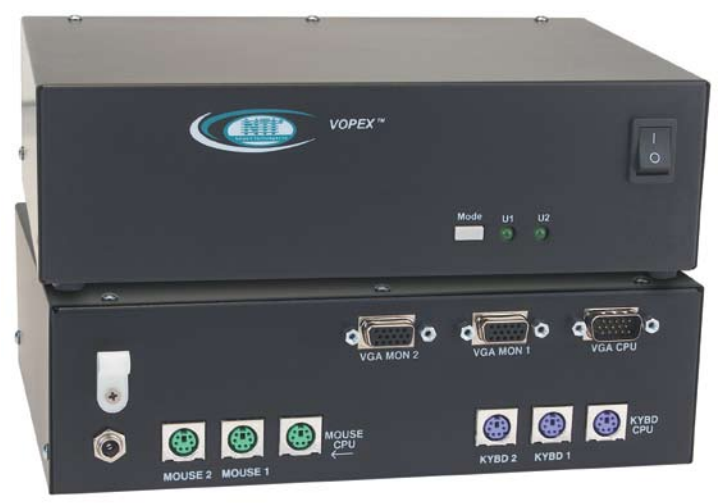
VOPEX-2KVIM-A (Front & Back)