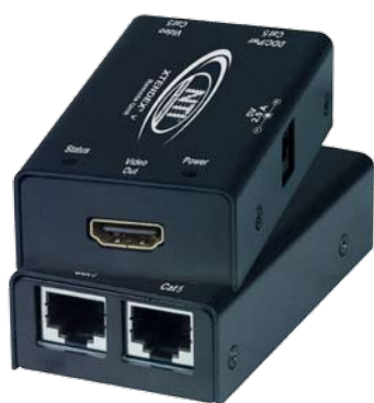
XTENDEX® ST-C5HDMI-300-LC (Local and Remote Units)

Extend an HDMI or DVI display up to 300 feet away from a video source