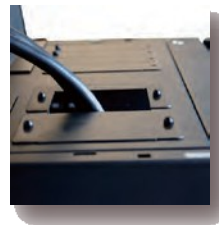
Roof Cable Ports & Covers