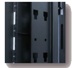
4 Universal Mounting Brackets