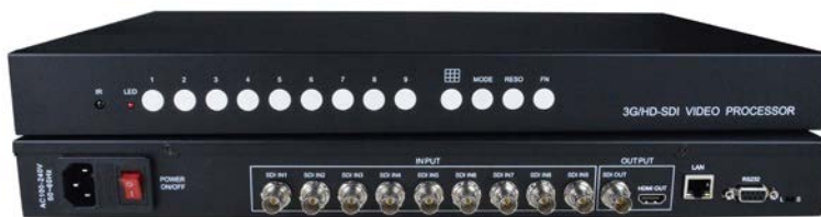
SPLITMUX-3GSDI-9 (Front & Back)