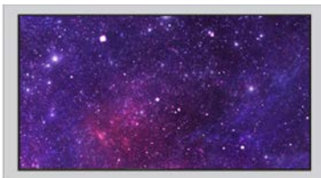
Full Screen Mode