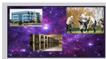
Custom Mode with Individually Configured Windows