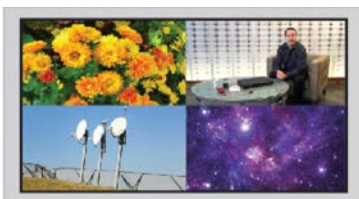
Quad Screen Mode