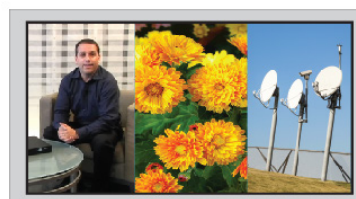
Triple Screen with Custom Mode