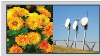
Dual Screen with Custom Mode