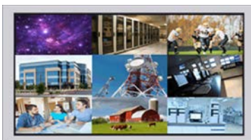
9-Segment Screen Mode