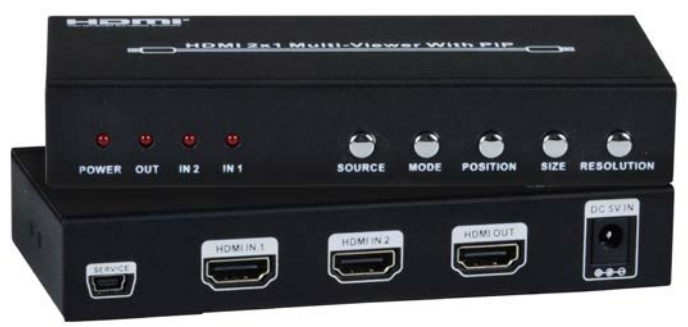
SPLITMUX-HD-2LC (Front & Back)